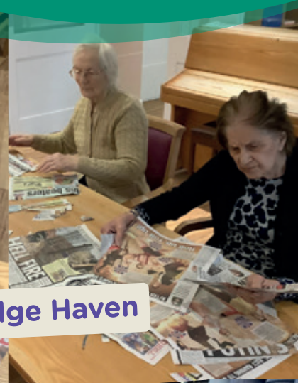
Paper Mache with Bridge Haven