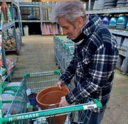
Amherst Court plant shopping