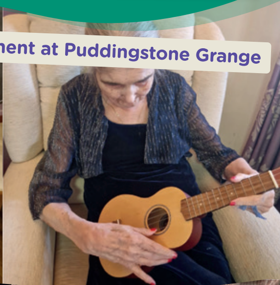
Musical moment at Puddingstone Grange