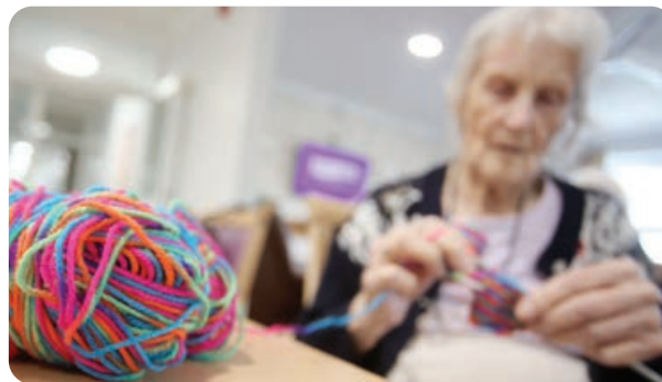
Personal interests are always encouraged, allowing residents to continue with favourite hobbies and pastimes.

I am forever grateful for the care that the staff have shown to my father. He has been treated with professionalism but also care and deep affection.