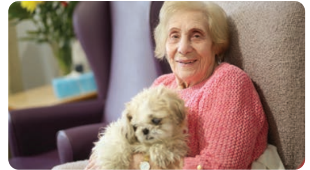
The residents love to see and interact with the animals which often visit the home.

Every fortnight the local church visits the home on a Thursday to hold a church service for the residents.