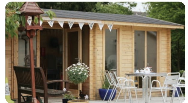
Court Regis has a 'Summer House' log cabin where residents and family can enjoy time together over a drink or food.