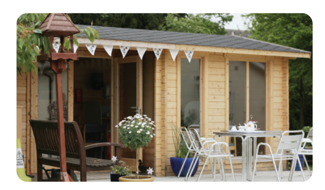
Court Regis has a 'Summer House' log cabin where residents and family can enjoy time together over a drink or food.