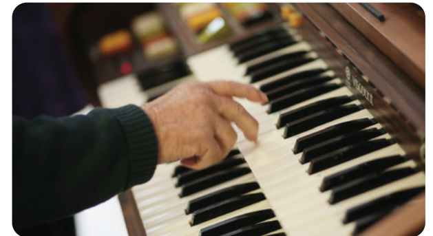
Entertainers visit Amherst Court regularly, providing music and activities for residents to join in and enjoy.