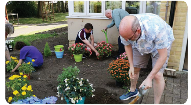
Residents enjoy getting stuck into some gardening, planting flowers, bushes and a variety of vegetables.