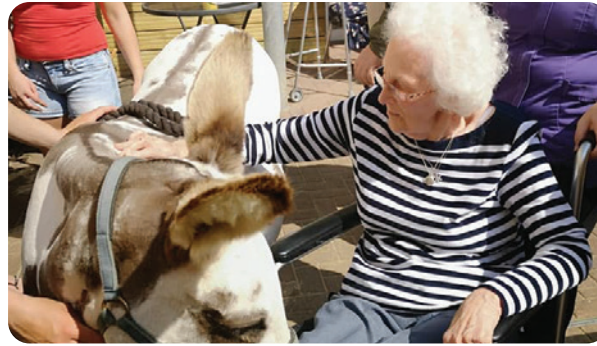
The residents love to see and interact with the animals that often visit the home.

Staff help develop interests and hobbies at Amherst Court and provide many opportunities to meet and make new friends