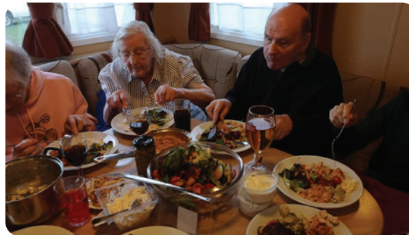
Residents from Amherst Court enjoying a meal prepared by themselves during their caravan holiday down by the coast.

After searching for a good local dementia care home, Avante came up tops. Mum has a lovely bedroom and is cared for at such a high standard. Mum is very happy there.